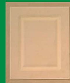
Stain Ready Raised Panel MDF