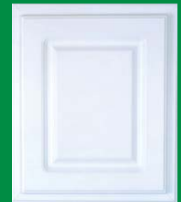
Finished White Raised Panel