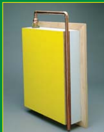
HIDDEN WATER LINE CHANNEL