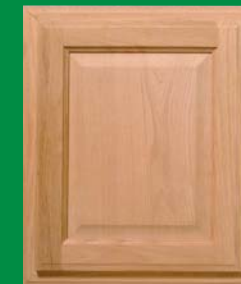
Stain Ready Raised Panel Hardwood