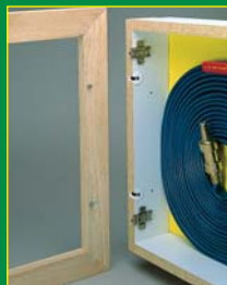
SNAP OFF FRAME