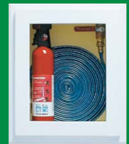
Finished White See Thru Raised Panel