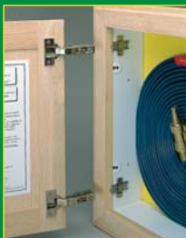
SNAP OFF DOOR